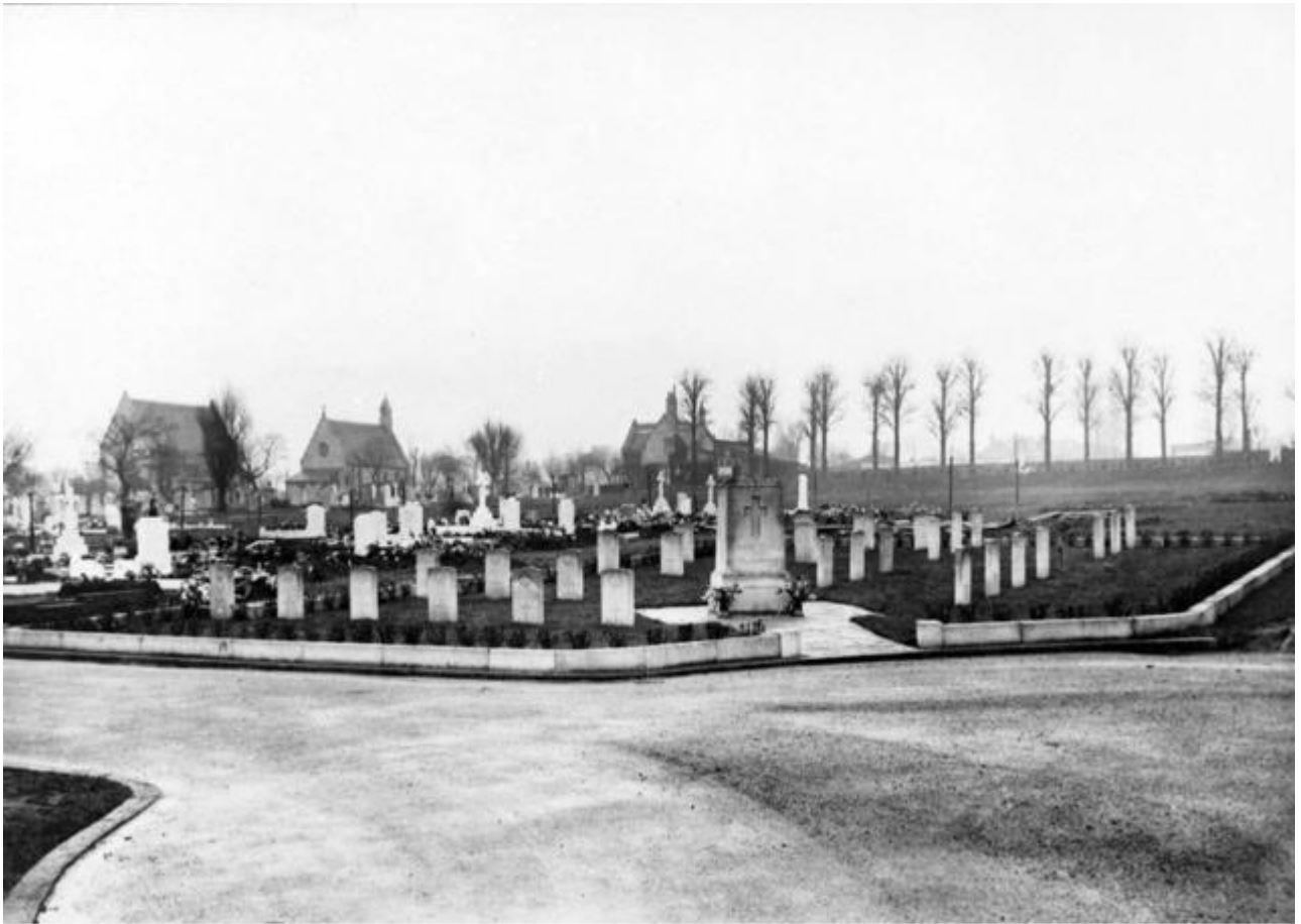
AUSTRALIAN WAR MEMORIAL