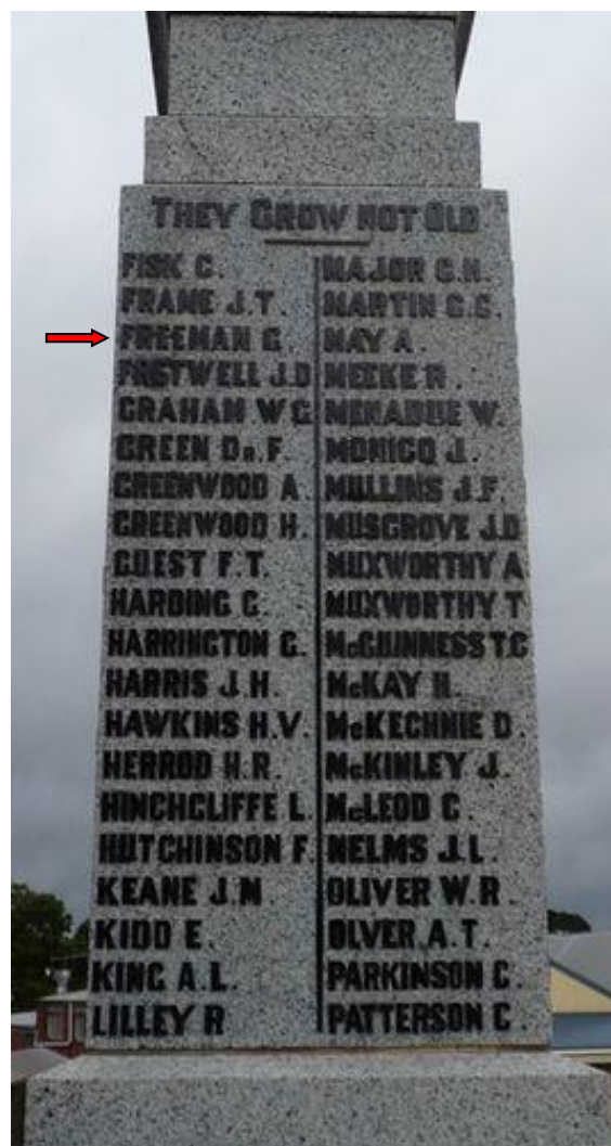
Daylesford War Memorial