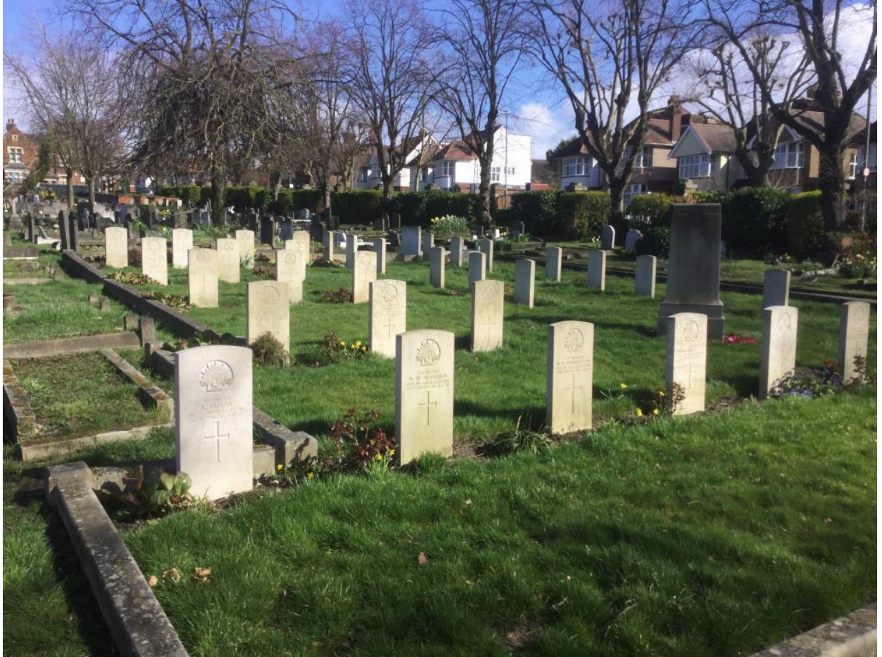
The Australian Plot in Wandsworth Cemetery, London