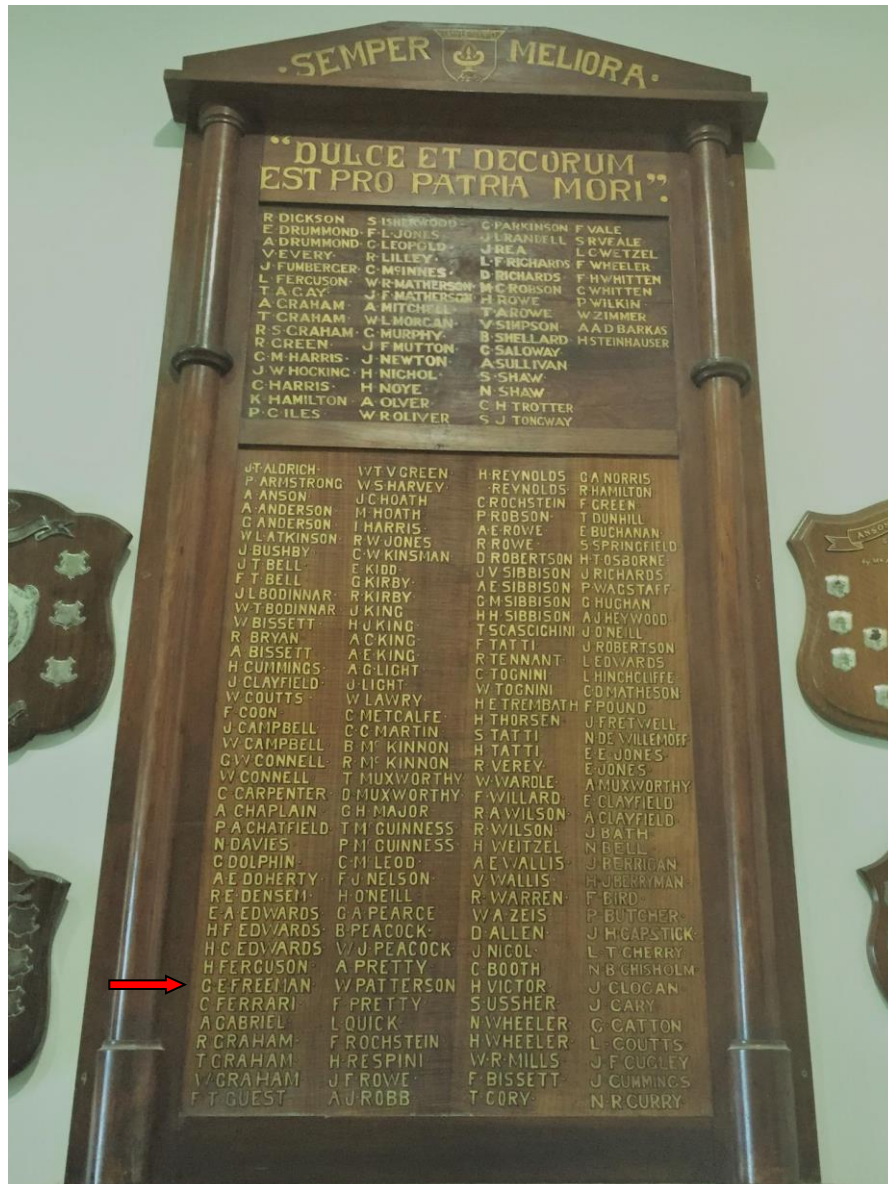
Daylesford State School Honour Roll