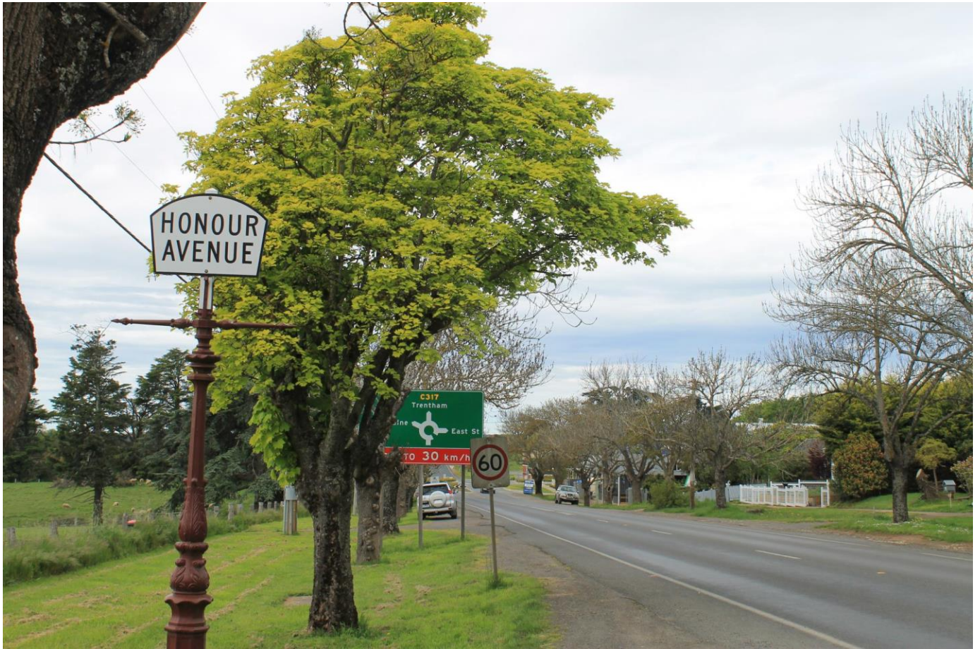
Daylesford Avenue of Honour